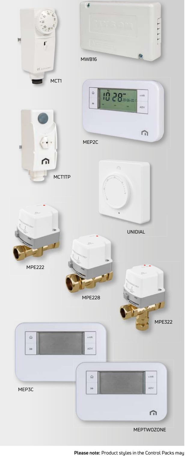
change, however, the function will still be the same.